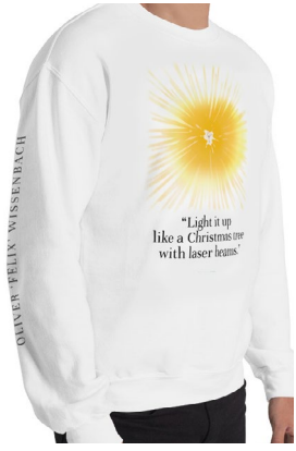
Get your Oli Christmas Jumper!

Ordering is simple, quick and easy at oliverwissenbach.com