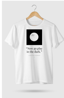
...and hoodies and hats and more...