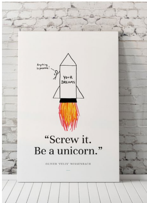
Wake up a wall with some Oli Wisdom!

These items are all a great way to have some Oli wisdom in our daily lives - and all make great gifts too!