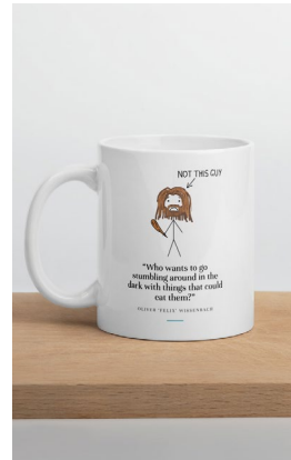
Oli loved a morning Americano - grab a mug