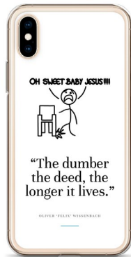
A phone case with meaning...